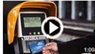
Tap & ride